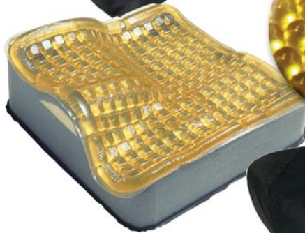
Action® Xact Individual - Cushion Base