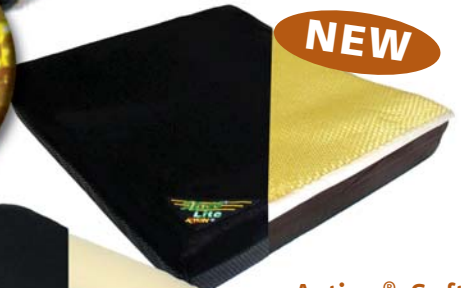
Action® Soft Cushion